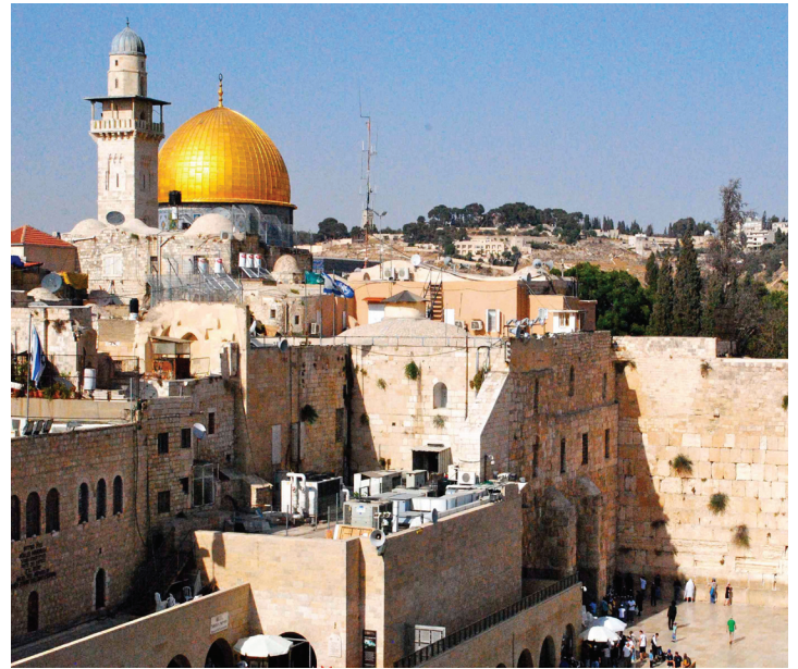
West Wall, Jerusalem.