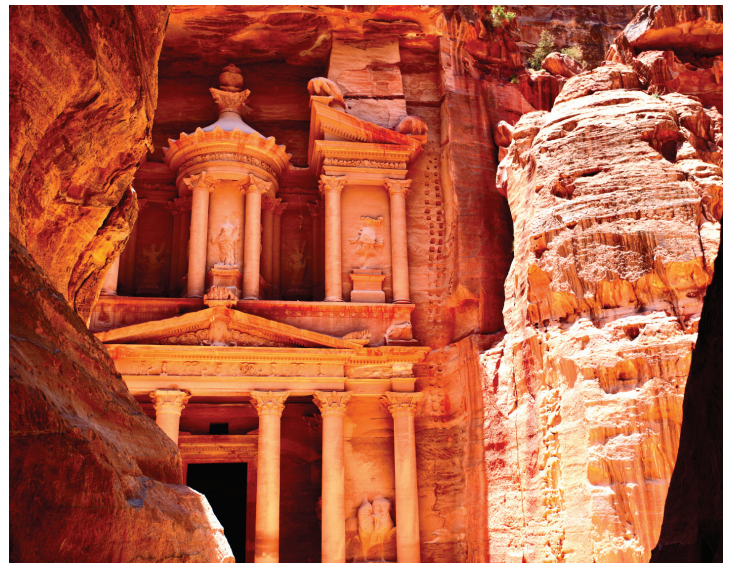
Petra, Jordan.